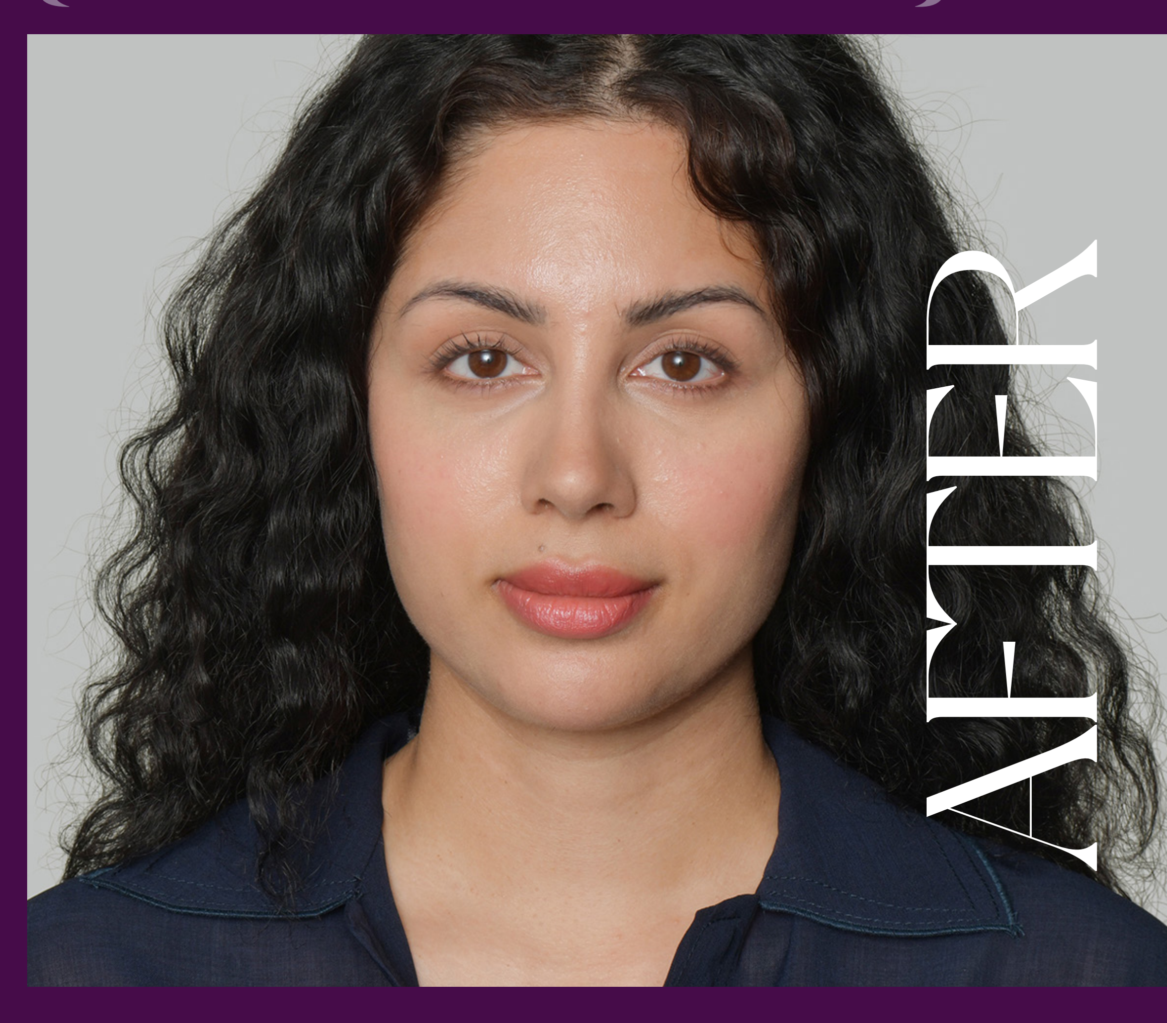
*Study conducted without lidocaine.¹º JUVÉDERM® VOLITE™ contains lidocaine.¹ The addition of lidocaine does not alter the product's physical properties.¹¹ Responses were rated on a 4-point scale (1: very dissatisfied, 4: very satisfied). FACE-Q Satisfaction with Skin score was calculated by summing the responses to the 12 items and converting to a scale score (range: o–100). Based on a FACE-Q Satisfaction with Skin score of 76.4% of patients (N=127) at Month 9.³

Over 90% of patients were satisfied with the results of their JUVÉDERM® VOLITE™ treatment at 1 month*3